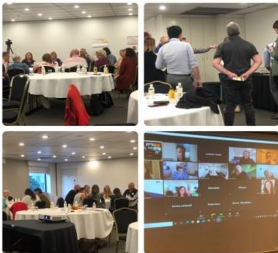
Photos of attendees at the MHLEEN Forum